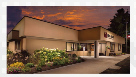
Adams Campus 401 North Main Adams, WI 53910