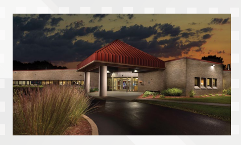
Marshfield Campus 2600 West 5th Street Marshfield, WI 54449