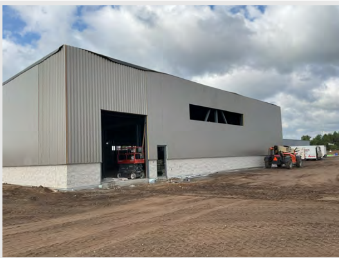
Insulated metal panel has moved past the north side of the building, moving closer to completion.