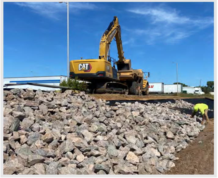
The site workers are placing the rock around the retention ponds