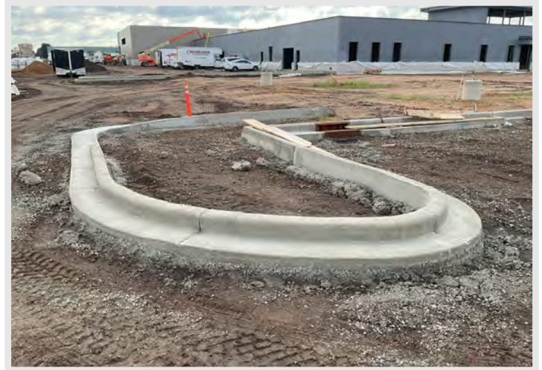
The curb and gutter has been poured around the site, outlining the parking lot and sidewalks.

Coming very soon we will see a lot of progress on the entire site. Concrete will continue to be poured around the exterior with sidewalks coming after the curb and gutter. After the masonry walls finish inside the building, the masons will move back outside to finish up the brick and stone veneer on the outside. Framing and MEPs will continue to install with the framers transitioning to drywall in the next few weeks.