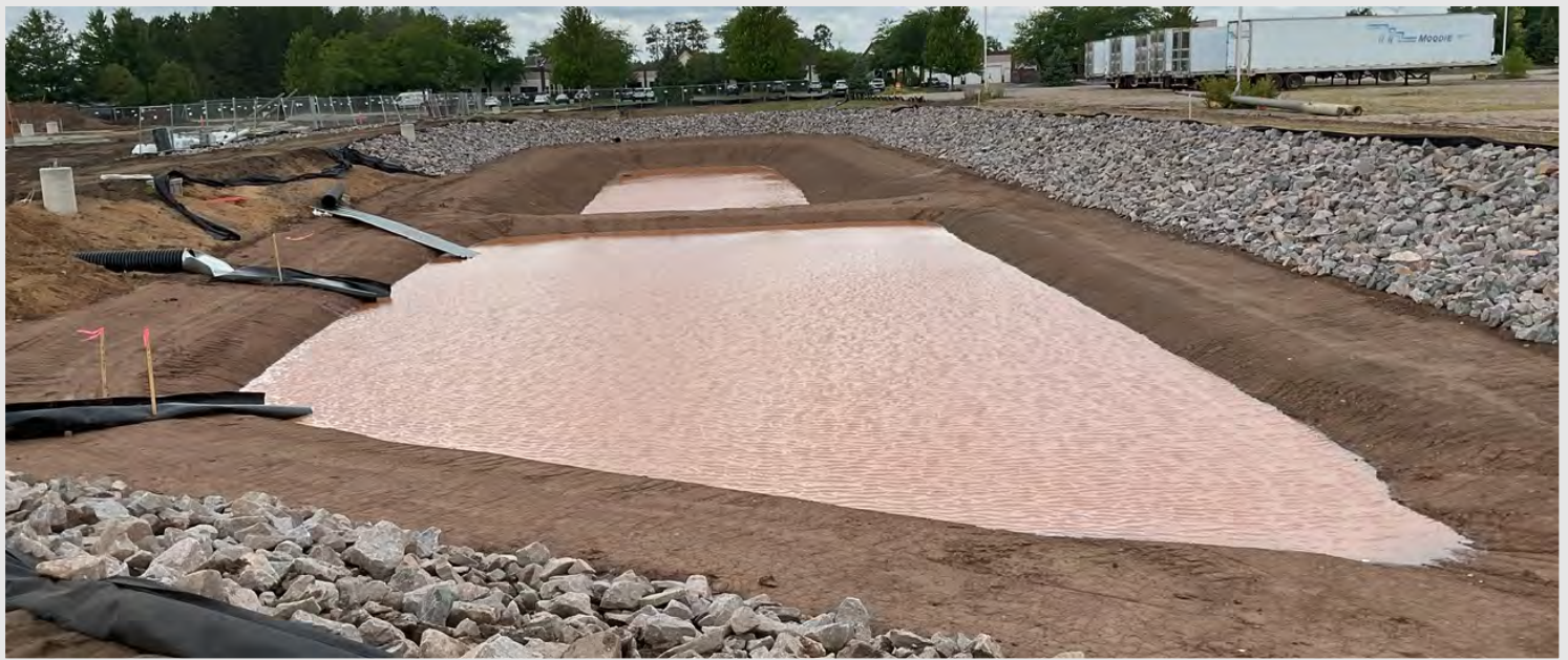
The retaining ponds are already holding water after all the rain we got this week.