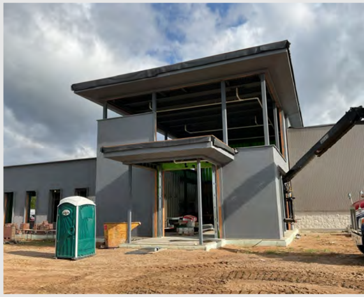
The air vapor barrier has been completed and the exterior sheathing is all sealed