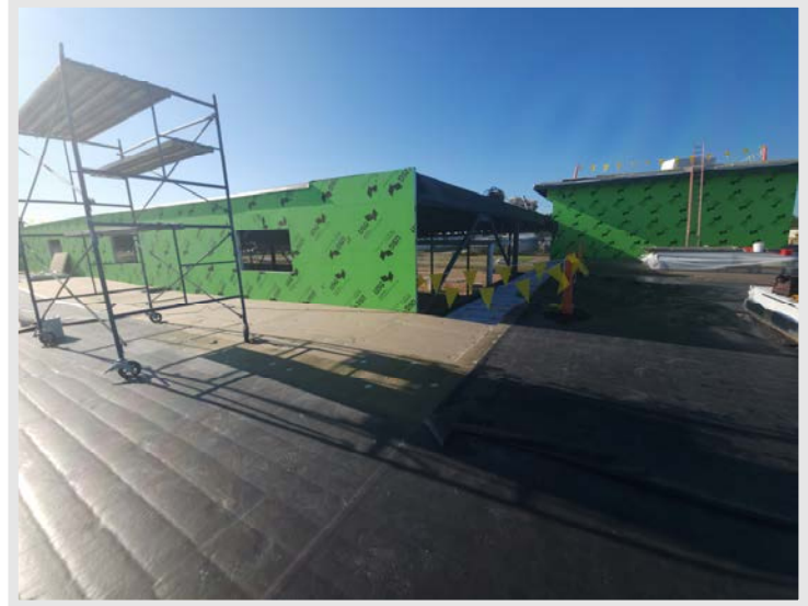
Roof membrane has been laid down on the majority of the building with only parapets remaining to be installed after they are completed.