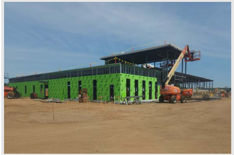
In this view of the South-West corner of the building you can see the installed sheathing and CMU being installed.