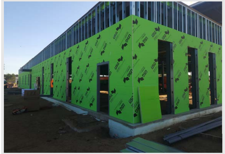
Exterior Cold formed metal framing, and sheathing being installed on the West end of the building.

The next few weeks will invite more of the exterior enclosure crews to site, with air and vapor barrier being installed over the exterior sheathing, and insulated metal panels starting to be installed onto the building. The next few weeks will really change the look of the overall building and allow us to get into the interior of the building with slab on grade being installed.