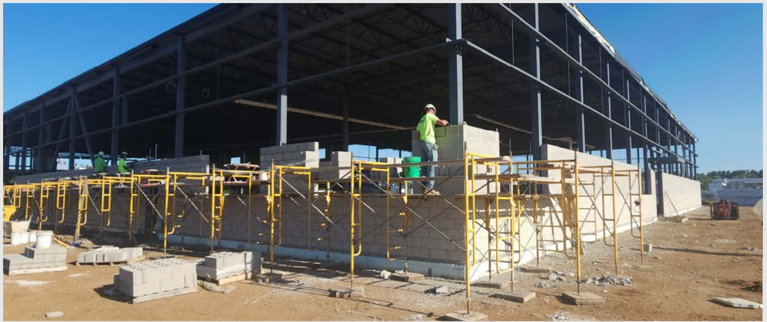
Masons have started installing the smooth face CMU ahead of the insulated metal panels that will be starting in the coming weeks.