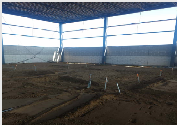
Electrical and plumbing underground is completed, and ready for slab on grade preparations to start.