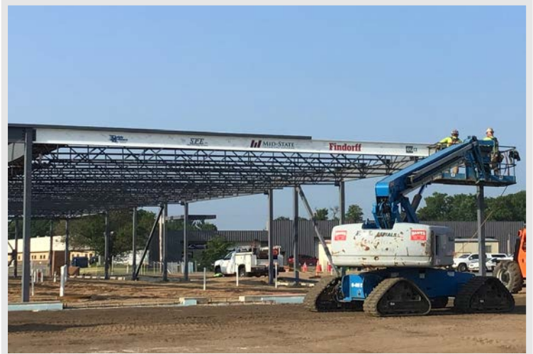
The signed beam is installed and getting details installed around it.