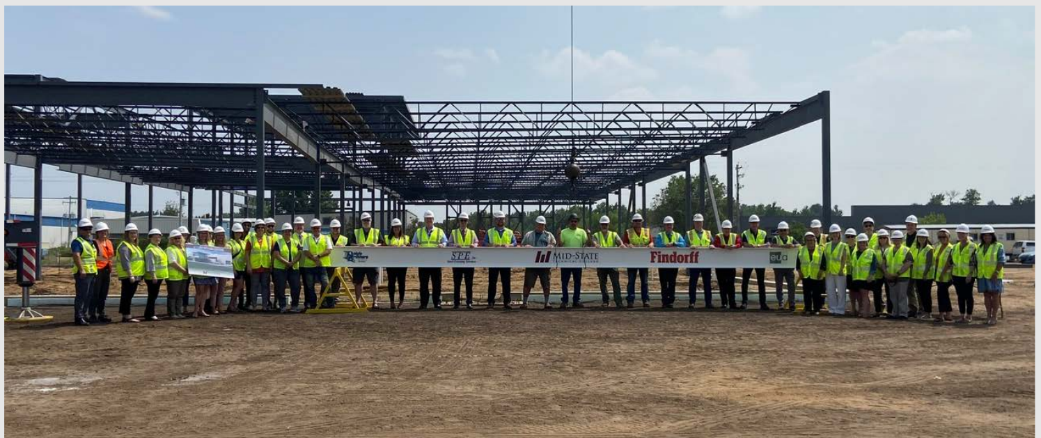
The Mid-State Technical College staff, along with other contributors to the new AMETA Center signed the last beam to be set into place.