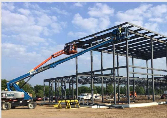
Ironworkers are installing the detail pieces so they can start soon on decking at the clerestory area.