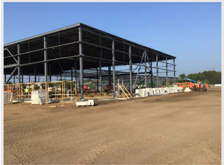
Structural steel on the Northeast corner of the building is complete, and masonry is set to begin.