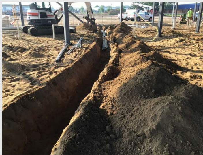
Underground Electrical is being trenched and conduit is being installed before the trench is backfilled for concrete