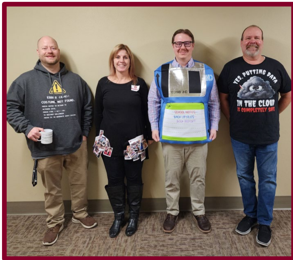
Figure 2-Photo from Halloween Contest