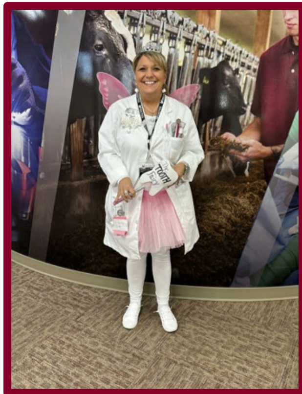
Figure 1-Photo from Halloween Contest