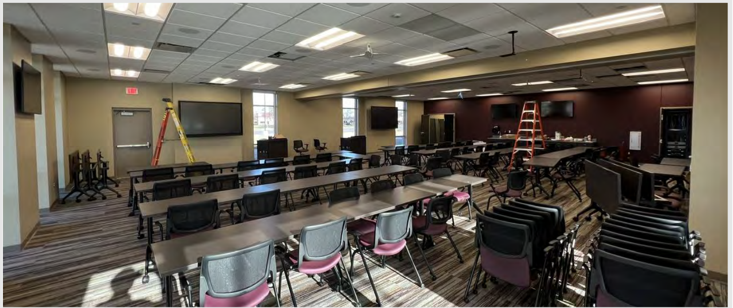
Tables and chairs have been brought into the Community Room, and monitors were installed.