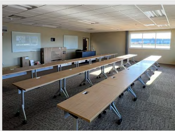
The Apprentice Classroom near its completed state with tables in place.