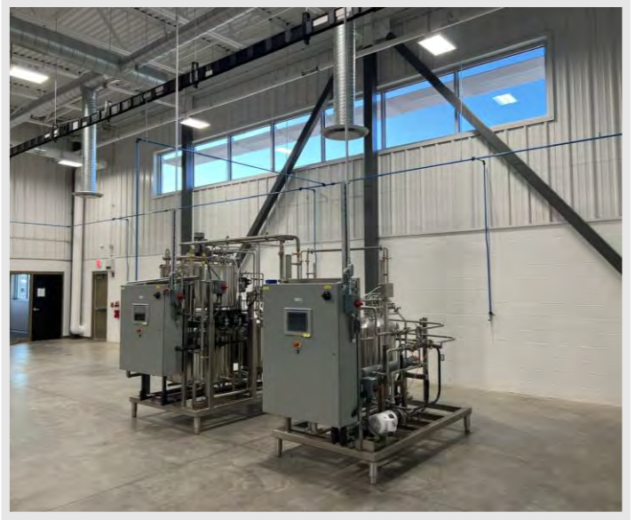
Equipment set into place in the Automation & Controls Lab.