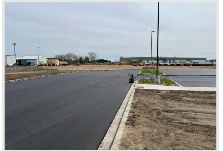
The first half of the parking lot receiving the asphalt topcoat on Friday, April 26 th .