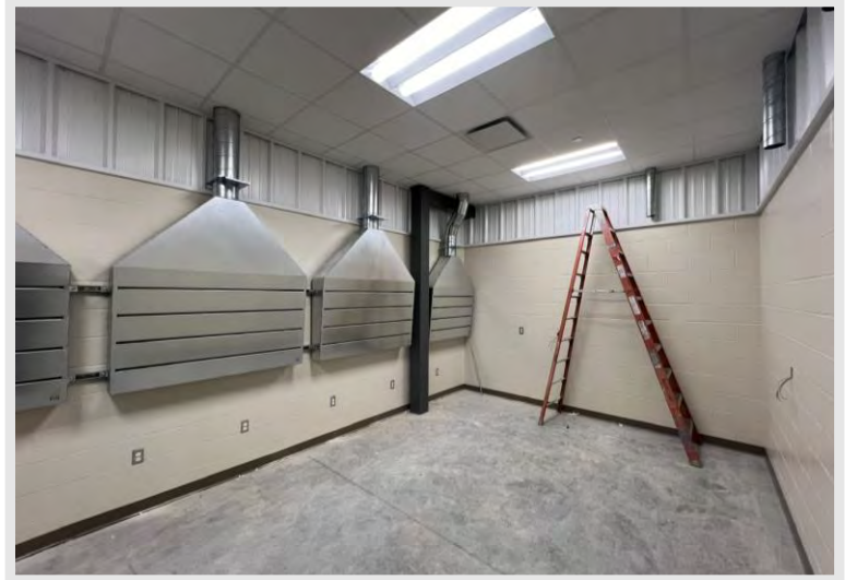
Slotted back shelf exhaust hoods are installed in the Grinding Room.

Parking lot lights have been turned on by the electrical contractor at the exterior. We await warmer weather for the remaining exterior work to continue, including the asphalt topcoat.