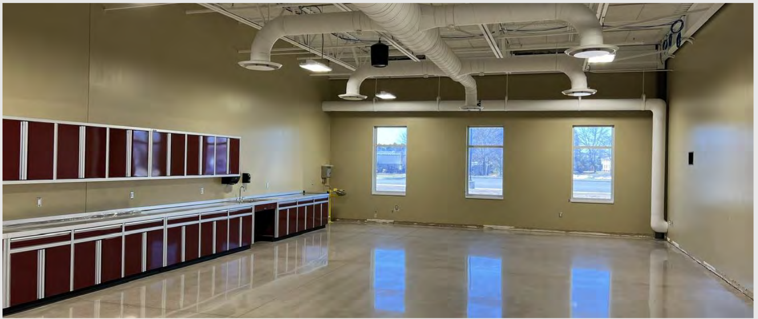
The Materials Lab had the polished concrete flooring completed over the past week.