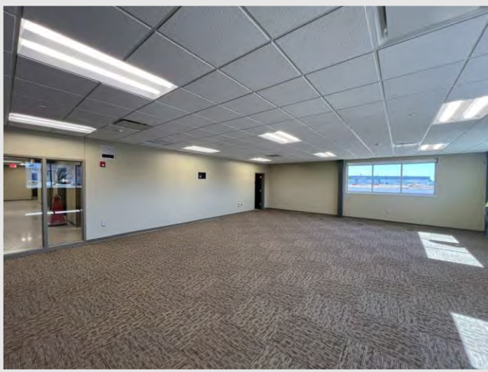
Rooms are looking sharp as final cleaning is starting throughout the project site in anticipation of furniture installation in the coming weeks.