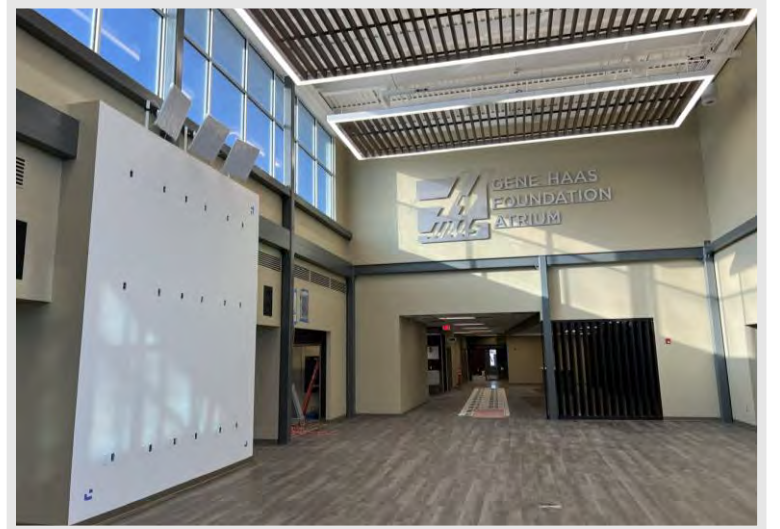
Notice the larger interior signage that has been installed in the Atrium.