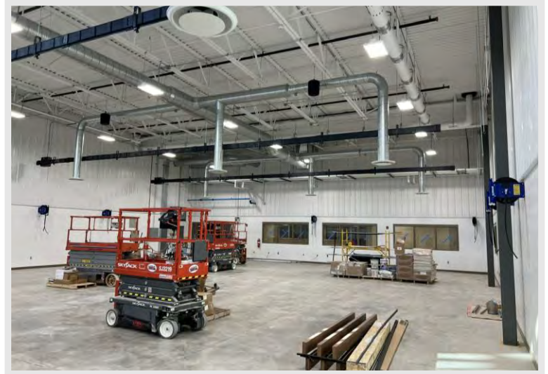
Mechanical and Electrical trades have worked their way through the Automation Lab, soon the Plumber will follow with compressed air install.

Roof Top Units (RTU's) are being prepped to startup in the week ahead, and temporary heating units will be removed from the project. This will allow glazing to be installed at the two storefront entrances where temporary heat was routed. Also, Findorff will begin install of wood doors in the week ahead!