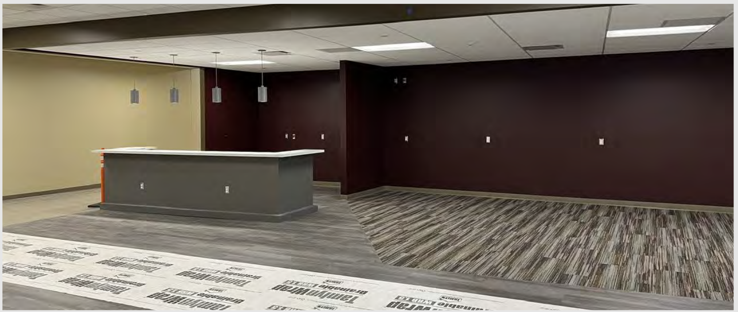
Flooring is complete throughout the student lounge area.