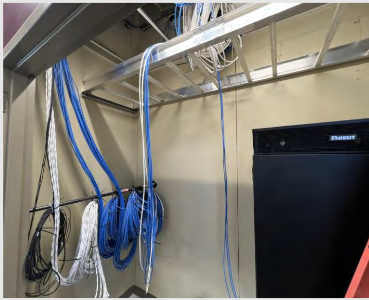
Trades are working towards making their final connections to data.