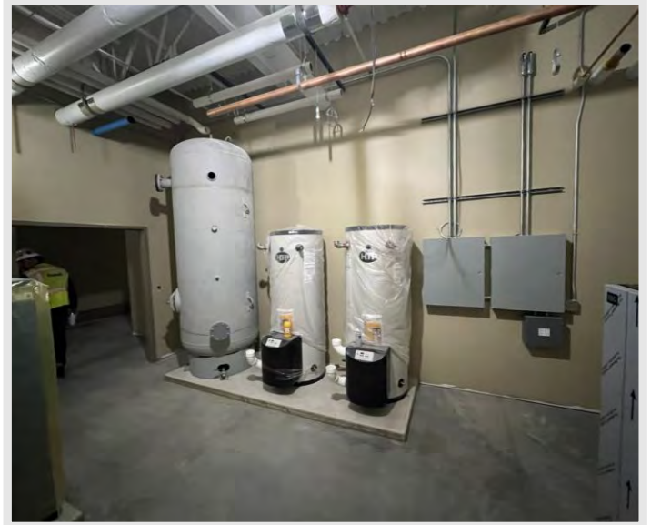
Over the past few weeks there has been MEP equipment set onto pads in the back of house spaces.