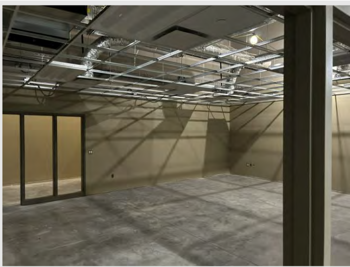
Ceiling grid installation is finishing in sequence two of the project and continues into sequence three in the weeks ahead.