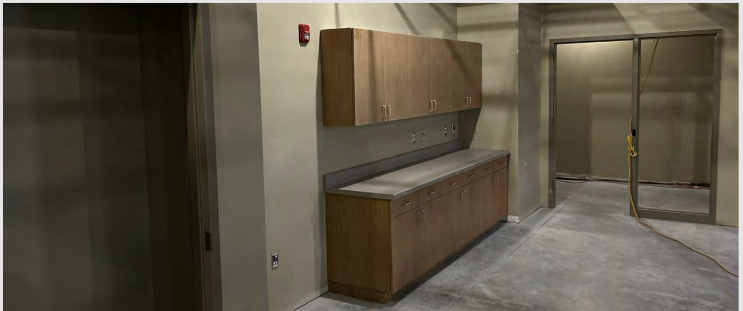
Casework has been installed throughout the building in the past couple weeks. Notice the upper and lower cabinets in the above photo.