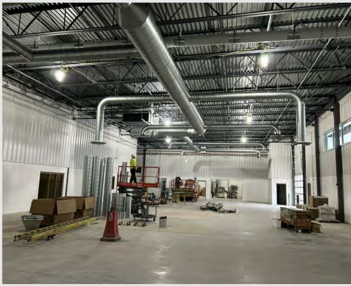
Ductwork install is nearing completion in the Machine Tool Technician Lab, and the final drops and diffusers are being installed.