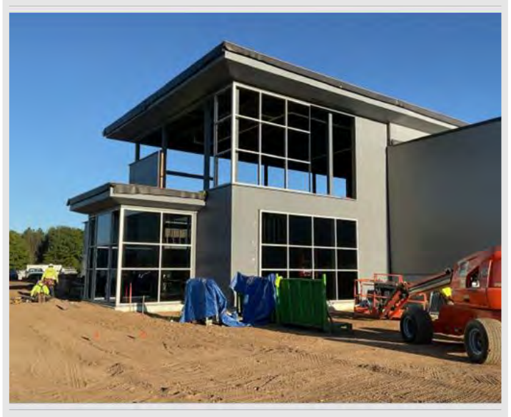
Aluminum storefront and glazing has begun to be set at the atrium and is continuing around the building.