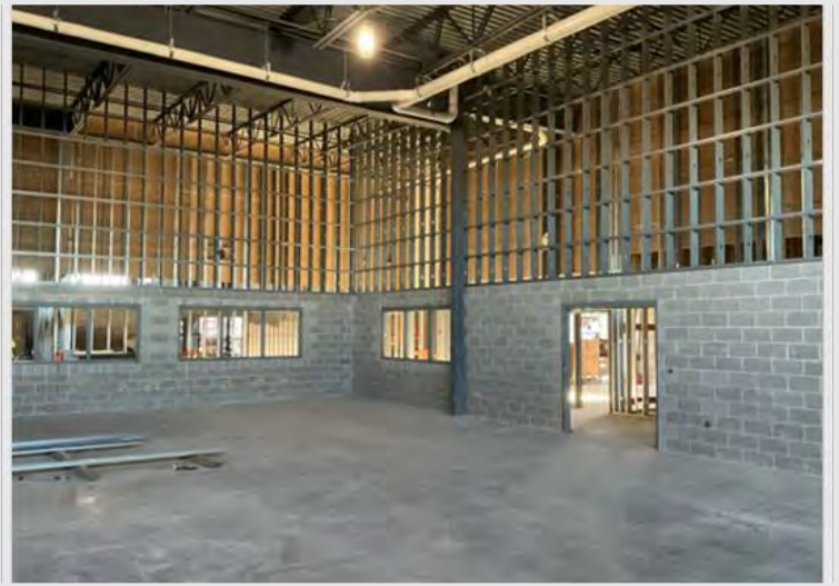
Nearly all masonry walls and cold formed metal framed (CFMF) walls have completed and rooms are taking shape.

The sequencing of interior work is coming as MEP rough-in work moving west to east continues so that insulation, drywall and taping can follow suit. As interior masonry walls are completed, the masons are moving back to the exterior brick and veneer work. Site preparation and site concrete continue in the next two weeks to make ready for the fine grading so asphalt crews can install the binder course. Exterior overhead door installation is in the coming weeks as enclosure of the building continues.