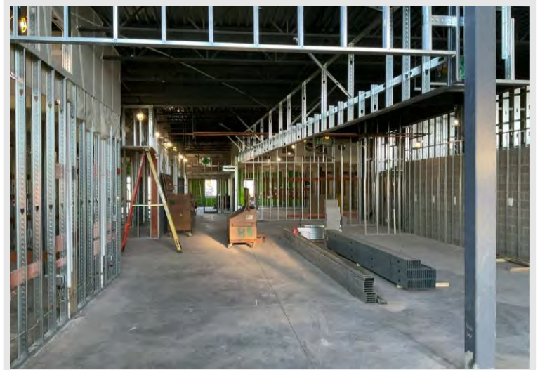
The interior is coming to life with architectural soffits and features being framed up.