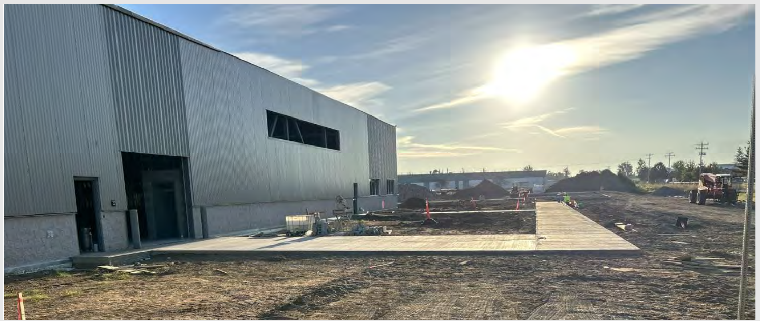
Site concrete has followed the installation of the curb and gutter with sidewalks, stoops, and drives now bringing the site towards its final state.