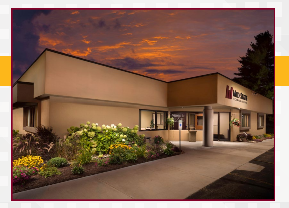
Adams Campus 401 North Main Adams, WI 53910