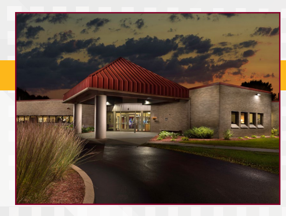
Marshfield Campus 2600 West 5th Street Marshfield, WI 54449