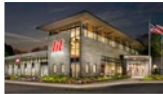
WISCONSIN RAPIDS CAMPUS 500 32nd Street North Wisconsin Rapids, WI 54494