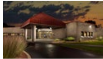
MARSHFIELD CAMPUS 2600 West 5th Street Marshfield, WI 54449