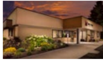
ADAMS CAMPUS 401 North Main Adams, WI 53910