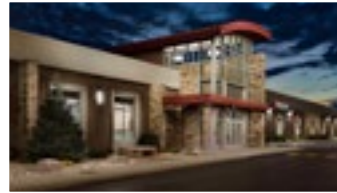
STEVENS POINT CAMPUS 1001 Centerpoint Drive Stevens Point, WI 54481